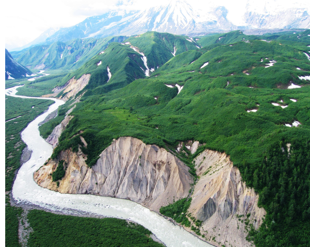
Geothermal prospecting permit area at Mount Spurr. M.L. Coombs.