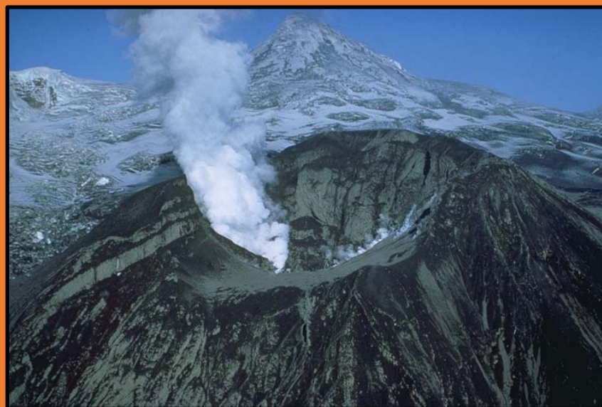
Active venting at Crater Peak following Sep 16, 1992 eruption (Mt Spurr visible to the north)