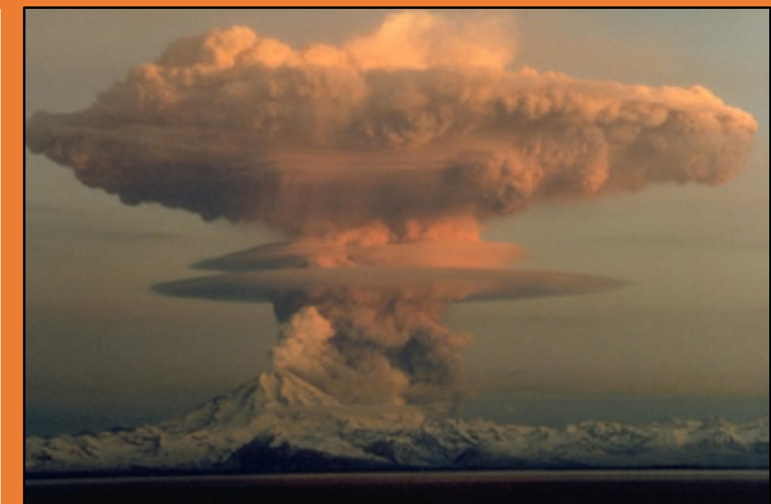
Redoubt Volcano eruption on Apr 21, 1990